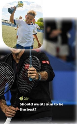
Should we all aim to be the best?

Everyone is different, with different talents. We can respect and celebrate the achievements of others and be thankful for the people in our lives who do the same for us.