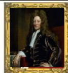
Sir Christopher Wren