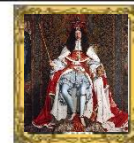
King Charles II